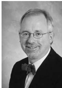
Dr. Kenneth Rockwood, MD, FRCPC

Specific drug treatments mean that the Alzheimer story is changing, and for the better. Still, drug treatment is controversial. Despite more than a dozen pivotal trials showing statistically significant benefits, some government agencies, including provincial formularies in Canada, claim not to understand whether treatment produces clinically meaningful benefits. This presentation will outline a systematic approach to the assessment of clinical meaningfulness. It begins by considering biological plausibility, looks for replicable, statistically significant effects that are large enough to be clinically detectable, show a dose response, and show convergence between outcome measures. Demonstrating that these criteria are each met for Alzheimer's disease drug therapy, it will next move to considering investigator-initiated Canadian trials that are aimed at demonstrating clinical meaningfulness by evaluating the extent to which treatment meets the goals of patients, caregivers and physicians. Based on these data, the presentation will argue that, on whatever grounds drug treatment might be held to be objectionable, absence of clinically meaningful benefits is not one of them. It will also propose that systematically assaying the experience of patients and caregivers can provide us with new insights into dementia neurobiology, so that we can continue to rewrite the story of what it means to have Alzheimer's Disease.